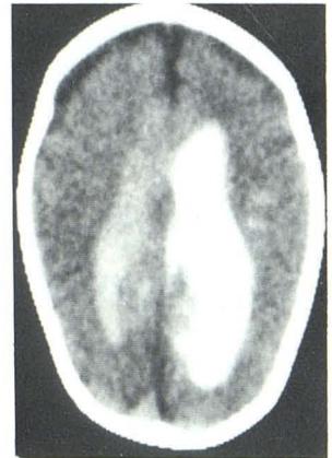
Fig. 2.—Case 4. CT cisternogram 3 hr after lumbar intrathecal injection of 4 ml metrizamide (150 mg iodine/ml). CT attenuation value in left lateral ventricle, 118 H; in right lateral ventricle, 38 H. Ventricular reflux predominantly unilateral. (H = Hounsfield units.)

findings, are indications for a shunt installation [12]. If there is no stasis, a shunt operation is not necessary. But the occurrence of totally or predominantly unilateral reflux with stasis requires insertion of an intraventricular shunt catheter in the affected ventricle.