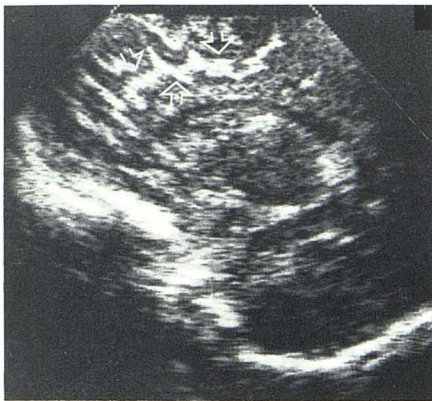
Fig. 1.—Left sagittal section showing bright convoluted markings (arrows).

Note.—None of these complications followed meningitis caused by group B Streptococcus (n = 1) or nonenterococcal group D Streptococcus (n = 1).