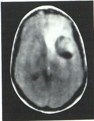
Fig. 2.—Axial transverse NMR scan in patient with giant middle cerebral artery aneurysm. Persisting lumen is a dark cleft posteriorly with laminated clot anteriorly. There is considerable edema anterior and medial to aneurysm.

(B) CSF appears white (see text). Position of aneurysm and its relation to other brain features are well shown on coronal (C) and sagittal (D) sections.