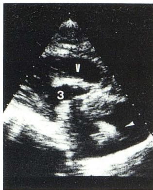
Fig. 1.— A , Sagittal paramidline sector sonogram. Dilated lateral ventricular (V) systems; third ventricle (3). Cyst in posterior fossa; hypoplastic cerebellum (arrowhead). B , Conventional CT scan shows characteristic shape of fourth ventricle and ballooned posterior wall limited by hypoplastic cerebellar hemispheres. C , Gross ventricular dilatation. Large right frontal bone defect. D , CT metrizamide ventriculography. Direct coronal scan shows contrast in dilated ventricular system and wide aqueduct (arrows). E , Direct sagittal scan. Contrast in lateral ventricles, fourth ventricle, and cyst. High tentorium. No contrast in subarachnoid spaces.