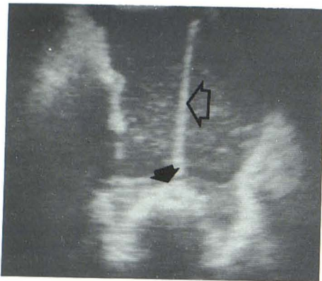
Fig. 1.—Case 1. Transverse intraoperative sonogram of L4–L5 laminectomy site. Microbubbles in saline bathe dural sac. Metal cannula ( open arrow ) demarcates dural interface ( solid arrow ), which is thickened and impedes acoustic signal to further through-transmission.

Initially, microbubbles were prominent in the water bath of the surgical site, but after a few minutes they resorbed to produce a clear space above the dural sheath. It was not necessary to actually put the transducer on the dural sheath