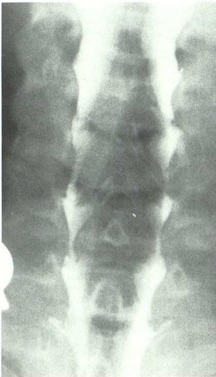
Fig. 1.—Cervical myelogram shows enlargement of spinal cord extending from C4 to C7.