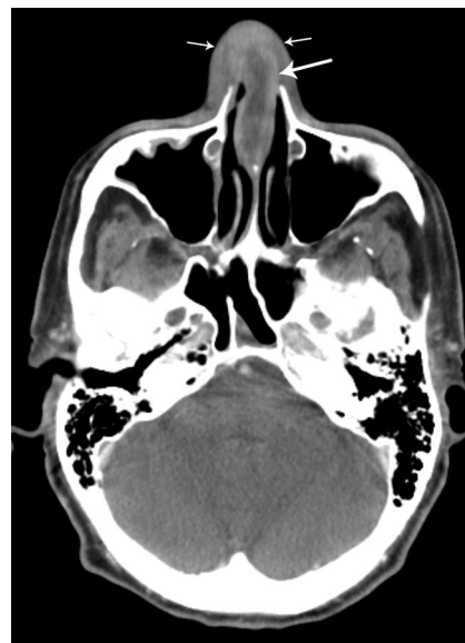
Fig 1. A 76-year-old man with acute myelogenous leukemia. CT imaging through the nasal cavity demonstrates a thin-walled, cystlike collection with peripheral enhancement involving the cartilaginous nasal septum ( large arrow ) consistent with a nasal abscess. There are no associated solid components. Note the swelling of the adjacent nasal soft tissues ( small arrows ).

Patient 2 was a 17-year-old adolescent boy with a history of T-cell lymphoblastic lymphoma in complete remission. The patient was on chemotherapy consisting of modified hyper-CVAD (fractionated cyclophosphamide, vincristine, Adriamycin, and dexamethasone). The patient reported a recent history of minor nasal trauma and complained of frequent blowing of the nose secondary to allergic rhinitis, and nasal tenderness for the previous 2 to 3 days. On clinical examination, there was a mild amount of edema and erythema over the dorsum of the nose with mild tenderness and the presence of a saddle deformity. The white blood cell count was elevated to 13.1 K/UL. Fiberoptic examination of the nasal cavity was performed, which re-