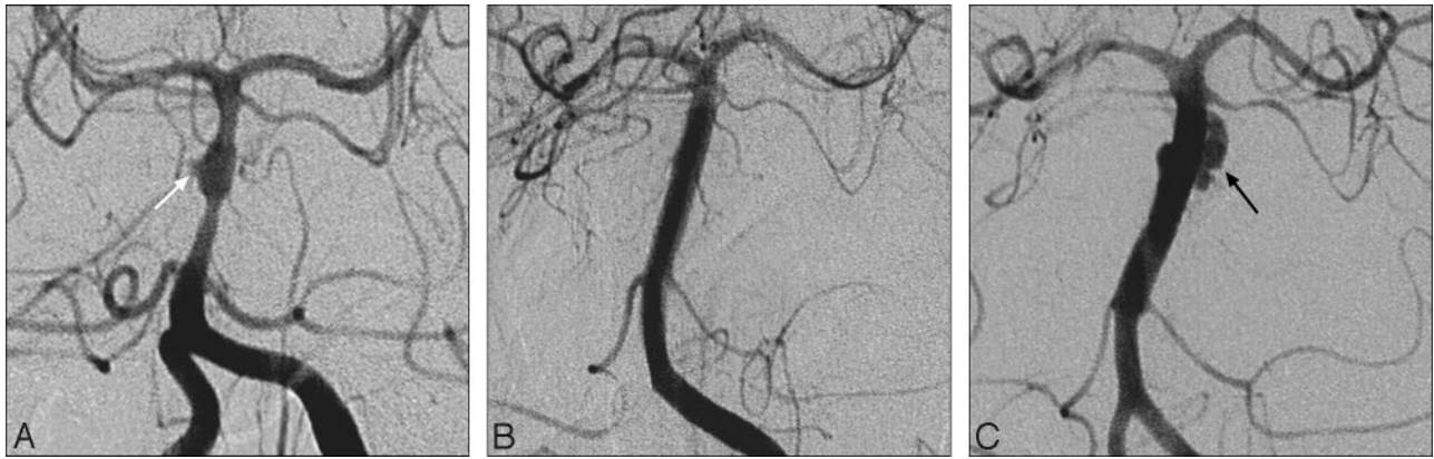
Fig 3. Images in a 24-year-old woman presenting with SAH. A , Left vertebral angiogram reveals an asymmetrical fusiform dilation with a bleb ( white arrow ) of the basilar artery. B , Left vertebral angiogram immediately after a balloon-expandable coronary stent insertion reveals near-complete obliteration of the dissecting aneurysm sac. C , Left vertebral angiogram performed because of rebleeding 3 days after the single-stent placement shows an irregular-shaped and enlarged pseudoaneurysm ( black arrow ) of the basilar artery.

the PICA occlusion. Also, the same authors reported 6 aneurysms at the PICA origin that were treated by coil occlusion, including the parent PICA in 2 and the VA and PICA origin in 4. 23 Lateral medullary and cerebellar infarction leading to hemiparesis developed in 1 of the 6 patients. These reports suggest that PICA occlusion may be more tolerable than expected. However, it was difficult to predict the consequence of PICA occlusion in ruptured vertebral dissection. In our experience and personal communication with the neurointerventional radiologist colleagues in our country, internal coil trapping including the PICA origin in ruptured vertebral artery dissections resulted in significant complications in 2 of 3 patients, including a massive cerebellar infarction requiring posterior craniectomy for decompression. Additional study on internal coil trapping including the PICA origin for treatment of ruptured vertebral artery dissections may be required. Therefore, our treatment policy was to select the method that did not sacrifice the PICA even in ruptured VBDA involving the PICA origin, unless the ipsilateral AICA was definitely dominant over the PICA.