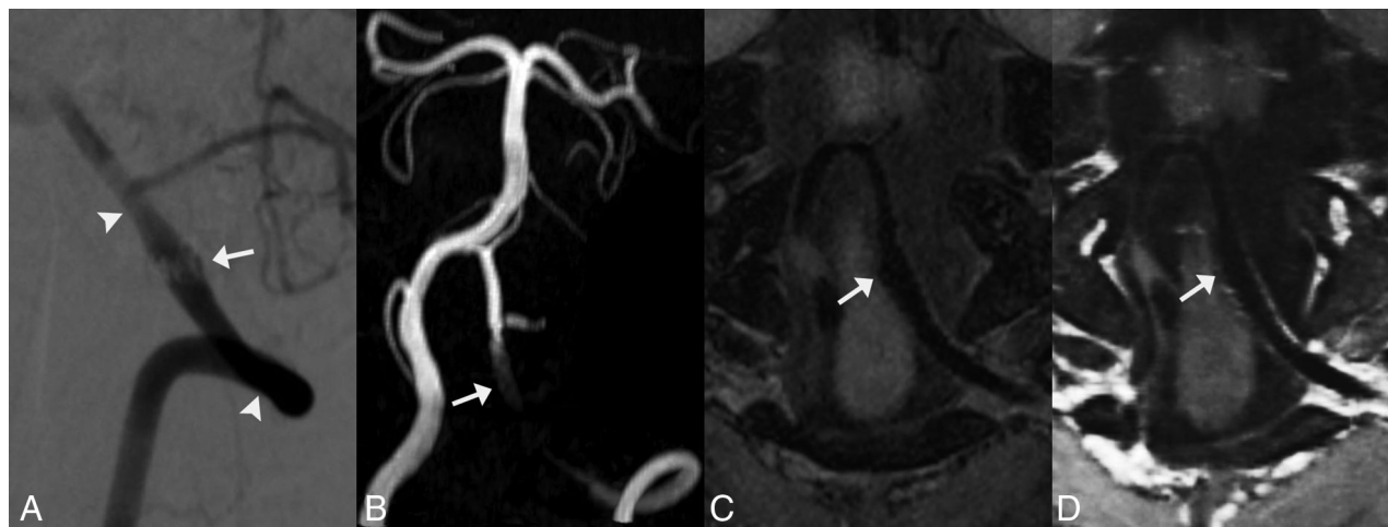
FIG 3. Follow-up images of a left vertebral artery dissecting aneurysm treated with Enterprise stent-assisted coiling at the sixth month postoperatively. A, DSA shows fusiform dilation (white arrows) of the left vertebral artery. The aneurysm is diagnosed as having incomplete occlusion. Arrowheads indicate the stent edges. B, The MIP image of TOF-MRA shows strong signal loss at the stented artery. The aneurysm remnant is not depicted. C and D, Pre- and postcontrast 3D T1-weighted SPACE shows a fusiform dilation of the parent artery, similar to the DSA findings. The aneurysm is classified as having incomplete occlusion on 3D T1-weighted SPACE. The postcontrast image shows mild enhancement of the stented artery. The image quality score for TOF-MRA and 3D T1-weighted SPACE is 1/1 and 5/5, respectively.