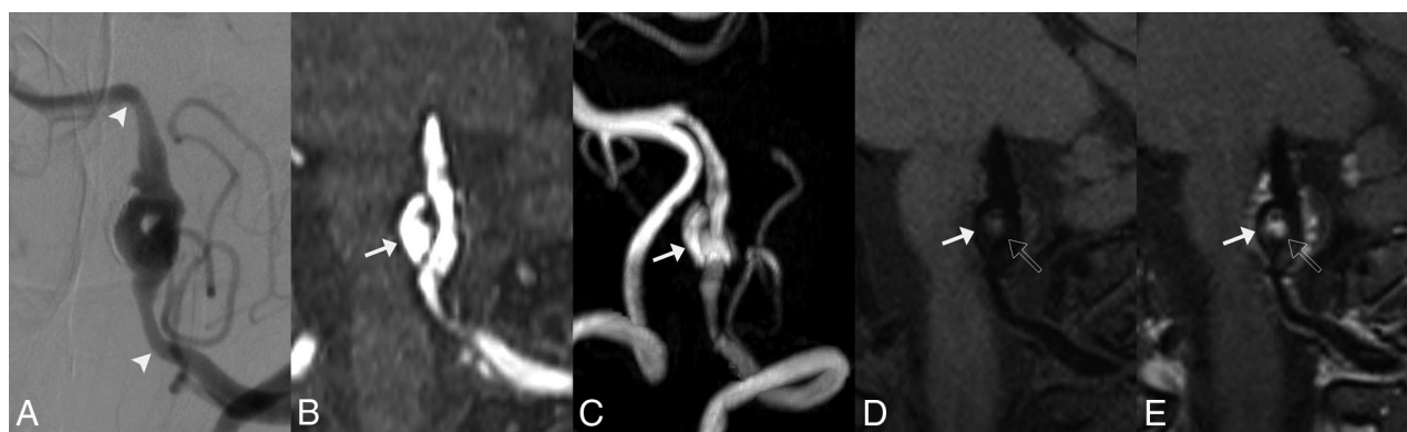
FIG 2. Follow-up images of a left vertebral artery dissecting aneurysm treated with LVIS stent-assisted coiling at the third month postoperatively. A, DSA shows recurrence of the aneurysm and mild stenosis of the proximal stented artery. Arrowheads indicate the stent edges. B and C, MPR and MIP images of TOF-MRA show the residual aneurysm lumen ( white arrow ) clearly. However, substantial artifacts and severe stenosis are observed at the proximal stented artery on TOF-MRA. D and E, On pre- and postcontrast 3D T1-weighted SPACE, the residual aneurysm lumen ( white arrow ) is depicted clearly, and an intramural hematoma ( outline arrow ) is observed. The depiction of the in-stent lumen is similar to that of DSA, with hardly any artifacts. The postcontrast image shows enhancement of the aneurysm wall, intramural hematoma, and stented artery. The image quality score assigned by the 2 reviewers for TOF-MRA and 3D TIWI SPACE is 2/2 and 5/5, respectively.

The sensitivity, specificity, positive predictive value, negative predictive value, and accuracy of TOF-MRA were 100.0%, 8.0%, 14.8%, 100.0%, and 20.7%, respectively. However, regardless of whether the simplified 2-grade scale or the 3-grade scale was used, the assessment results based on HR-VW-MR imaging were completely consistent with those based on DSA. Therefore, the intermodality agreement was 1.00.